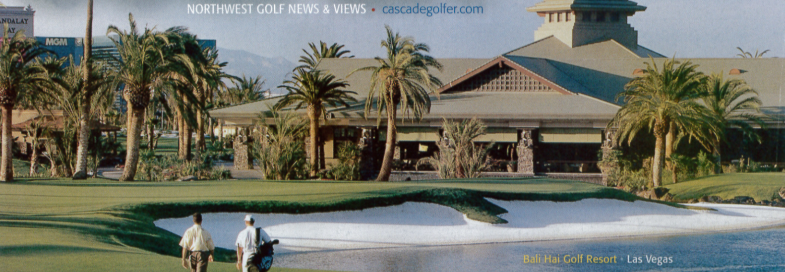
Bali Hai Golf Resort • Las Vegas