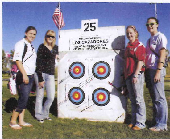
Flight Women's Competition