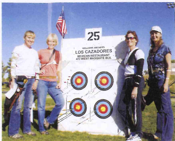
Classic Women's Competition